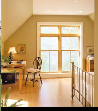
Sloped ceilings. The master bedroom shows the sloped ceilings of a 1½-story design, efficient and visually interesting. Exterior photo taken at A on floor plan; inset photo taken at B.